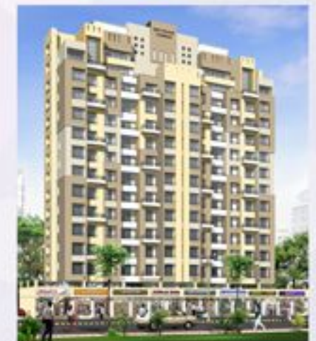
Dev Prasad Complex