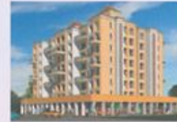
Dev Darshan Complex